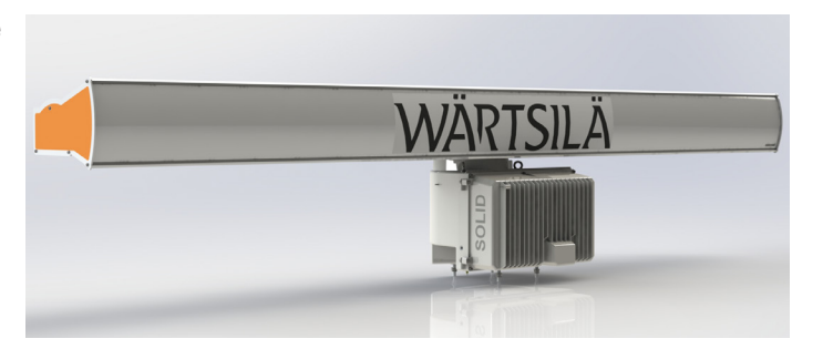
Fig.1 Conventional Magnetron vs Solid State Radar

The major advantages for customers are the added safety provided through optimized target detection under all environmental conditions, reliability thanks to the compactly designed transceiver, gearbox and antenna, and reduced lifecycle costs as a result of drastically reduced maintenance (no magnetron).