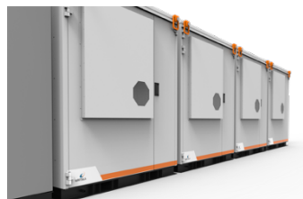
Figure 3: Interconnected system of GridSolv Quantum units

Ease of deployment: GridSolv Quantum is made with pre-designed jumpers and cables, in addition to unit-to-unit DC connection and AC auxiliary distribution—as well as signals, and communication interconnection—which are provided as part of GridSolv Quantum scope of supply. GridSolv Quantum is designed to minimize the amount of field wiring, civil work and trenching needed to deploy an ESS. The enclosures can be anchored to the foundation by either bolting or welding.