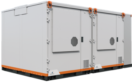
Figure 1: Enclosures can be combined to form a complete system, with up to eight enclosures linked together